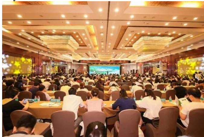
Figure 1 Overall education in China

For vocational education, it is the important duty of colleges and universities to cultivate skilled professionals and help the development of society. Based on this, the integration of production and teaching is an essential link in vocational education activities. However, in the past, examination-oriented education has a wide range of influence in the overall education of our country, and vocational education has also been influenced by it, which has failed to form a teaching mode in line with the trend of social development. In addition, many vocational colleges do not have a clear and accurate orientation of education, so that vocational education in our country in professional teaching and practical production practice produce disjointed phenomenon, which is not conducive to the development of society. Based on this, the state expresses the support for the integration of vocational education and education, which is helpful to promote the vocational colleges in our country to clearly position the talent training and to train the talents more in line with the enterprise development for the society.