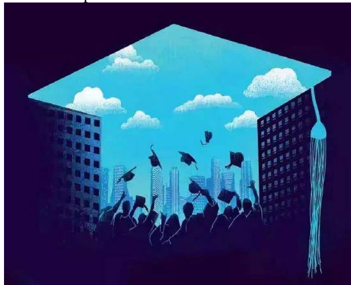
Figure 2 Promoting corporate brand culture

Integration of enterprises and schools is an important manifestation of integration of industry and education, besides the integration of system and value, cultural integration is also a necessary step. For vocational colleges, educating people is an important component of their campus culture. In the traditional campus culture, the humanistic atmosphere, cultural atmosphere and exploring spirit of the school are beneficial to the development of students' physical and mental health and the normal operation of school teaching work. However, vocational education is more important is skills teaching, the campus culture is too single easy to cause students to look at the situation that will not even learn to use. At the same time, enterprises often ignore the cultural construction because of the pursuit of economic benefits, which makes the corporate culture stiff and cold. And the integration of production and teaching can form complementary, let students feel the corporate culture, enhance the promotion of students' vocational skills to help enterprises deepen the humanistic connotation and promote the sublimation of corporate brand culture.